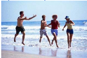
Energy and Vitality

Experience & Expand YOUR Effectiveness in the areas of: