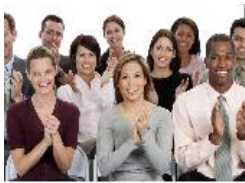
Reaching Your Goals & Realizing Your Dreams!

Isn't it time to have a CLEAR PATH to Your Future!?!