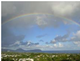
Manifesting Your Dreams