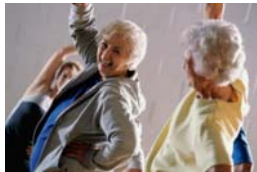
Being Happy with Your Body Image (you choose: release or attract those extra pounds and inches!)