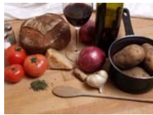
Healthy Eating styles